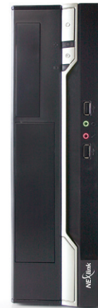
Small Form Factor